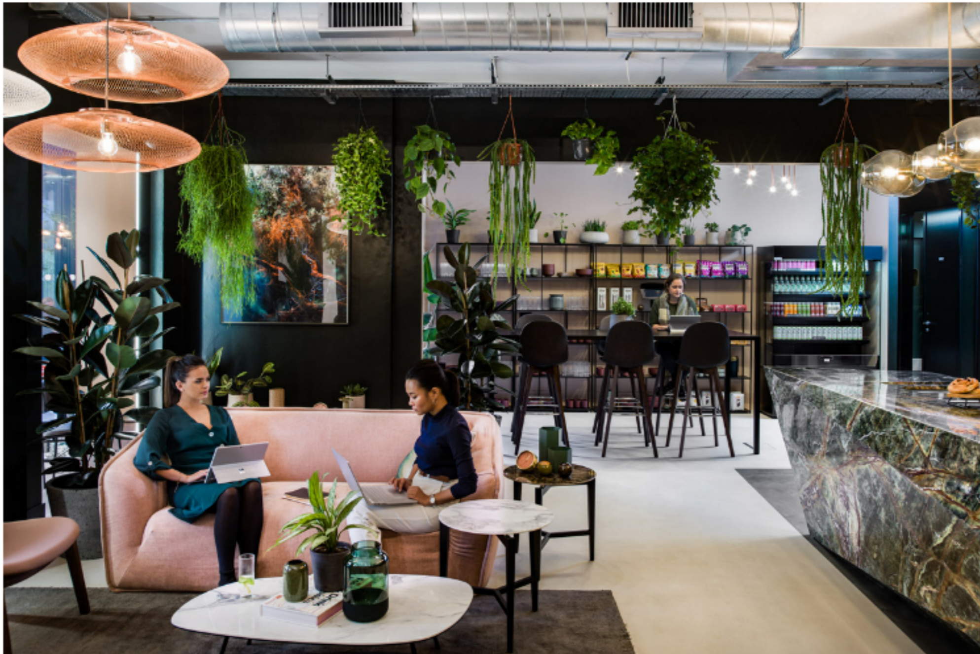
6th March 2020 | IN OFFICE DESIGN | BY SBID